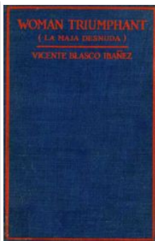
Woman Triumphant , a translation of La maja desnuda by Vicente Blasco Ibáñez into English

His life, it can be said, tells a more interesting story than his novels. He was a militant Republican